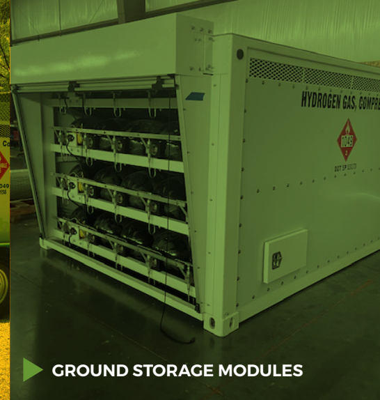
GROUND STORAGE MODULES