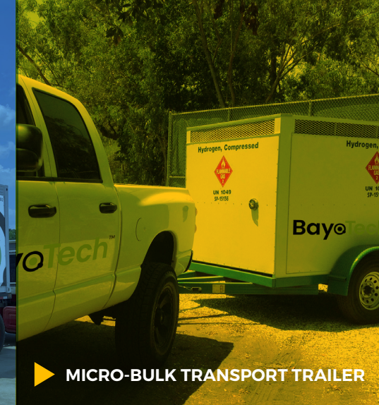
MICRO-BULK TRANSPORT TRAILER