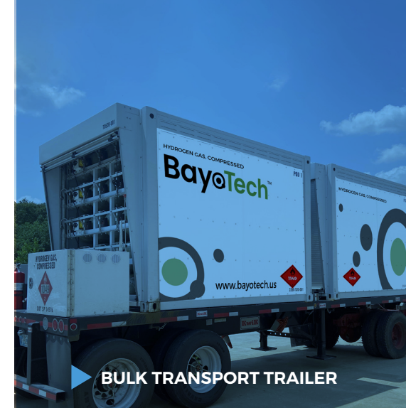
BULK TRANSPORT TRAILER